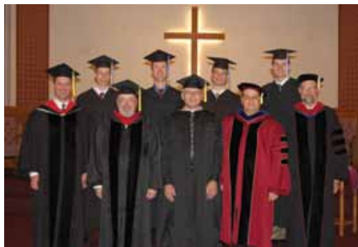
Graduates and faculty