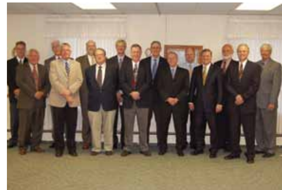
Mid-America's Board of Trustees at Commencement

A highlight for the Board of Trustees was the opportunity for the entire Board to attend the Seminary's commencement service on