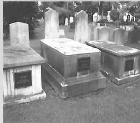
The tomb of Charles Hodge

In response to the reverence, affection, and gratitude expressed on that occasion, Hodge said, "A man is to be commiserated who is called upon to attempt the impossible. The certainty of failure does not free him from the necessity of the effort. It is impossible that I should make you understand the feelings which swell my heart almost to bursting." The much-loved and deeply-loving Hodge died on June 19, 1878.