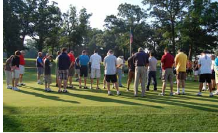
Gathering for prayer before the golf outing starts

Following the outing, Mid-America provided a lunch to all the golfers. We thank the participants and all the generous sponsors for making this event possible. Mark your calendar for next year's outing scheduled for September 6, 2014.