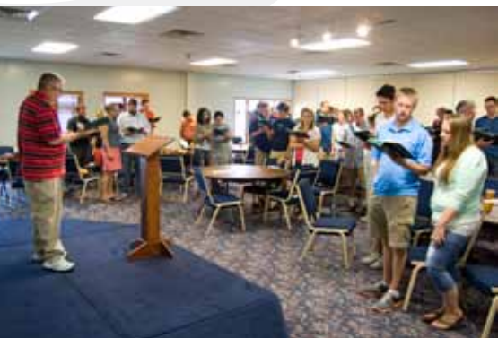
Students and Faculty singing at the retreat

The annual Seminary retreat was graced with rich fellowship and excellent teaching that overrode unusually high temperatures and humidity. Faculty and students, with spouses, attended the retreat on August 27 at Cedar Lake Conference Center.